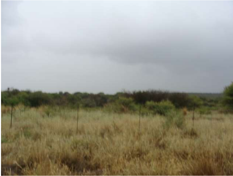
Figure 11: Area where the new Ulco substation is to be erected.