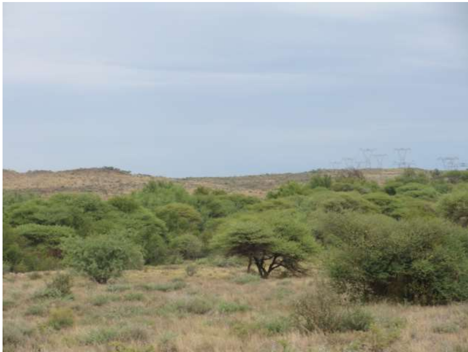
Figure 10: Example of one of the low hills along Alternative Two.