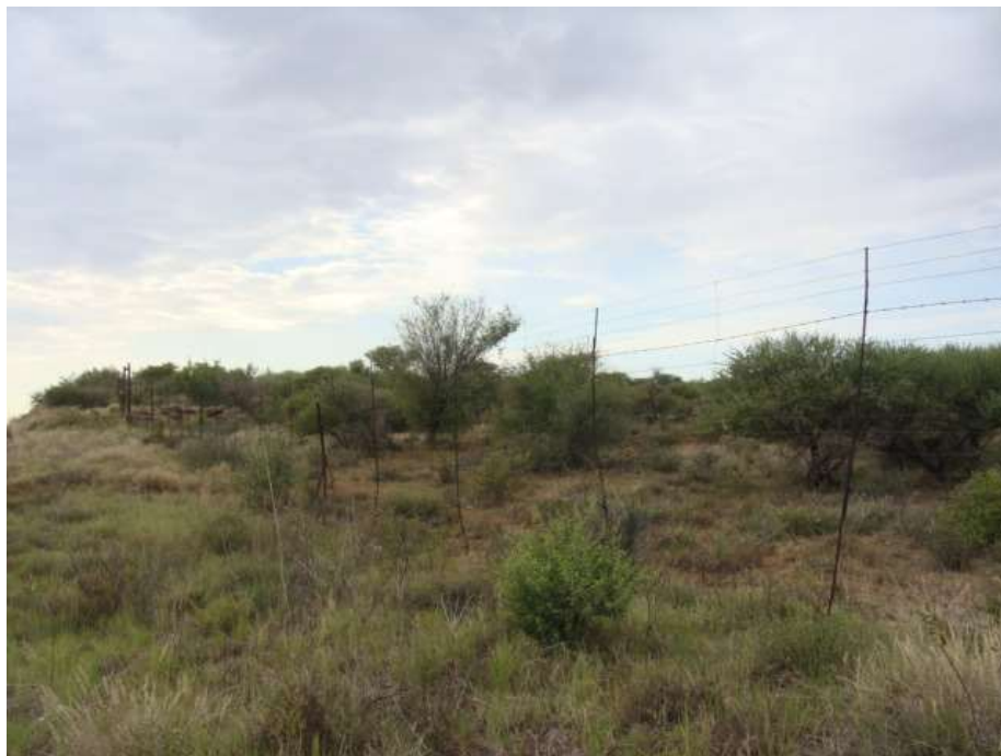
Figure 5: View of vegetation on a sand dune along Alternative Two.