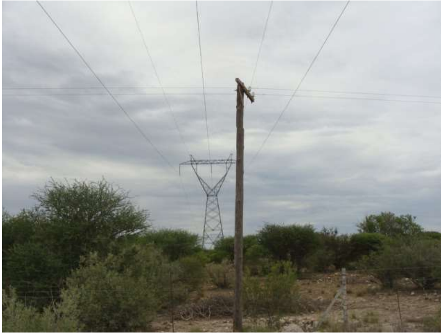
Figure 7: General view of area around existing power lines along Alternative One.