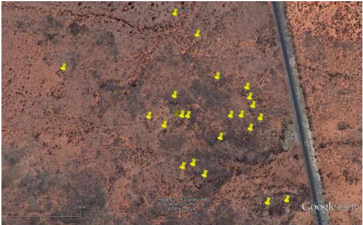
Figure 12: Remains of Historical mining site.

The site is regarded as having a medium cultural significance as it seems not to be unique for this area. It reminds one of the site described by Beaumont (2012), closer to Barkly West. The field rating for the site is high/ medium, Local Grade IIIB. The site should therefore be included in the heritage register and may be mitigated.