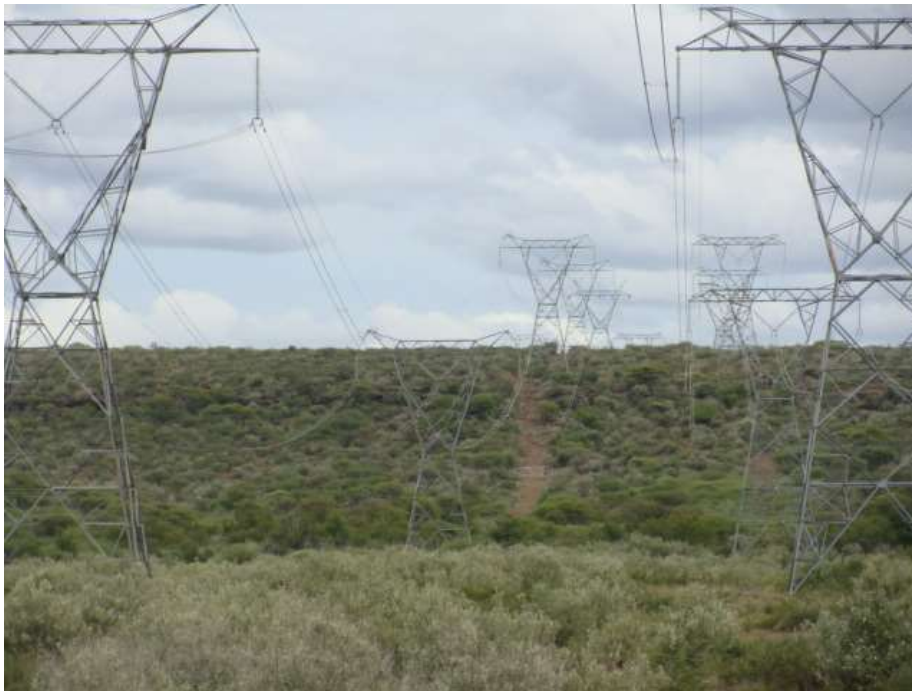
Figure 8: Another view of vegetation, sand dunes and existing power lines along Alternative Two.