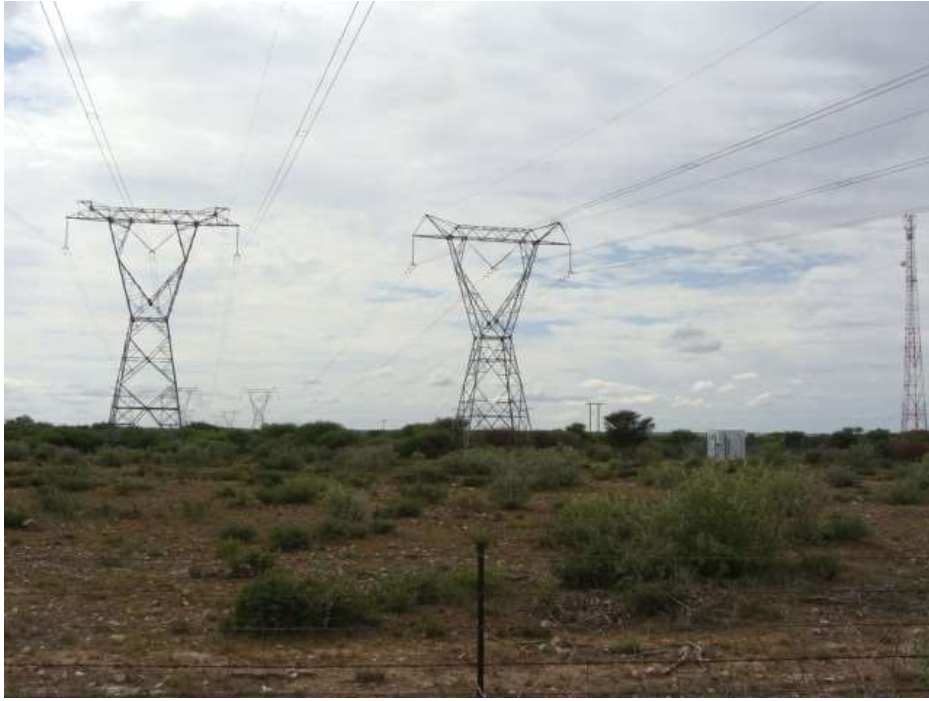
Figure 9: Another view of scarce vegetation and existing power lines along Alternative Two.