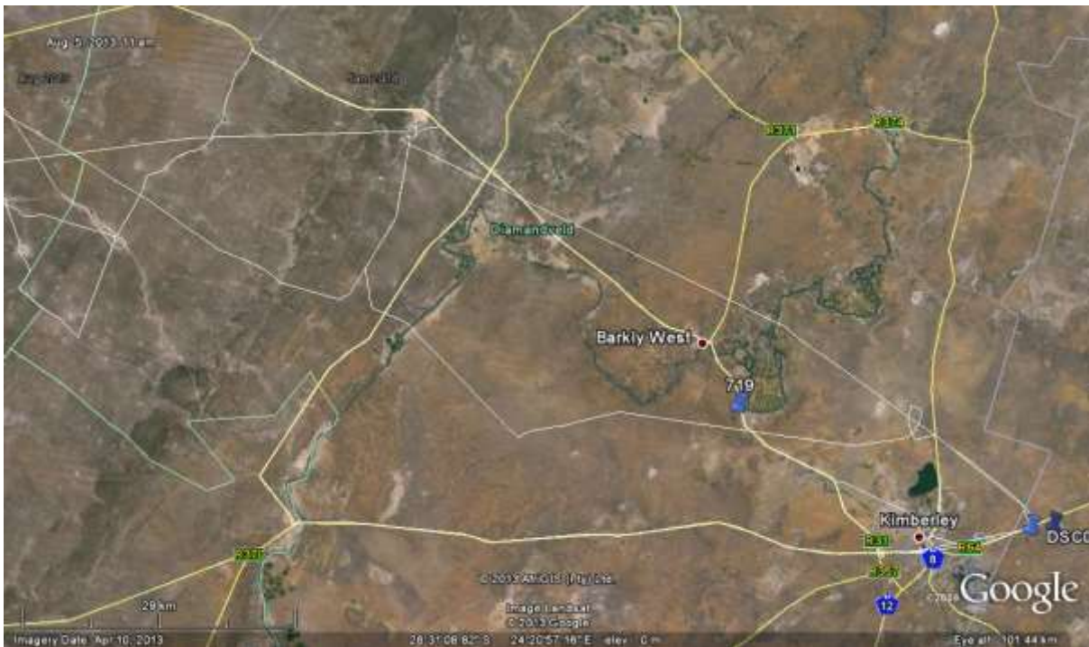
Figure 3: Track route of the surveyed routes.