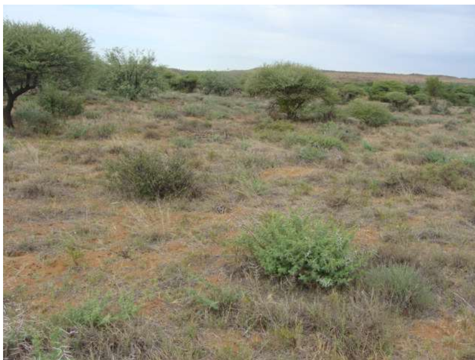
Figure 6: Red sand and low vegetation along Alternative Two.