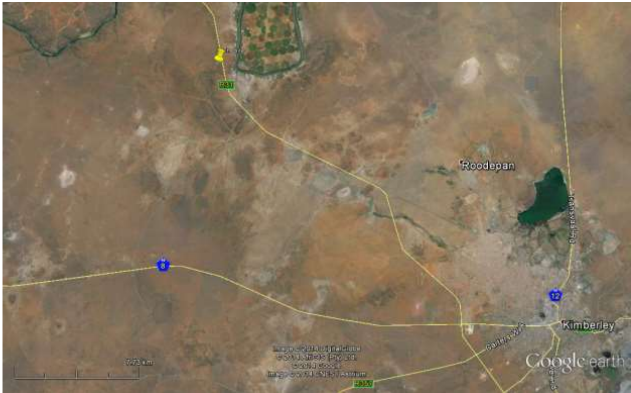
Figure 13: Location of the sites identified during the survey.

The final recommendations are as follows: